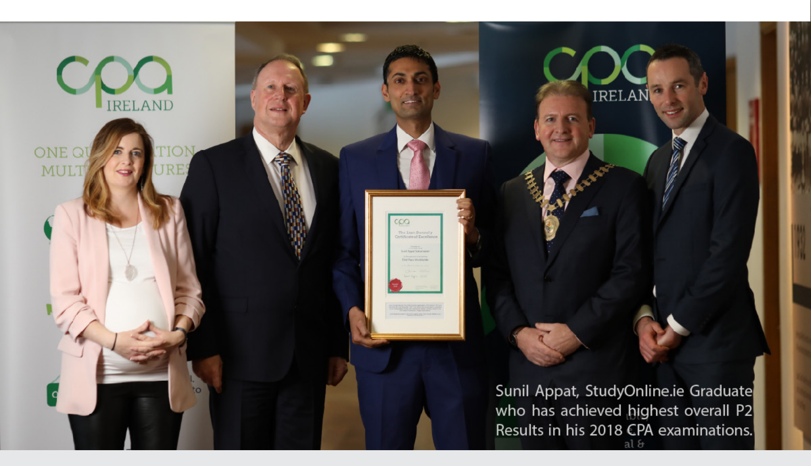
Further information and enrolment options to be found at this link: https://studyonline.ie/cpa/

Strategy & Leadership Advanced Corporate Reporting Advanced Audit Practice & Assurance Advanced Taxation Strategic Performance Management